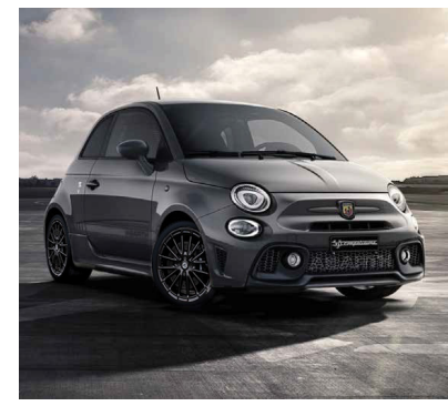
Record Grey (695) Option