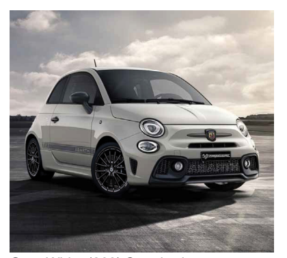
Gara White (268) Standard