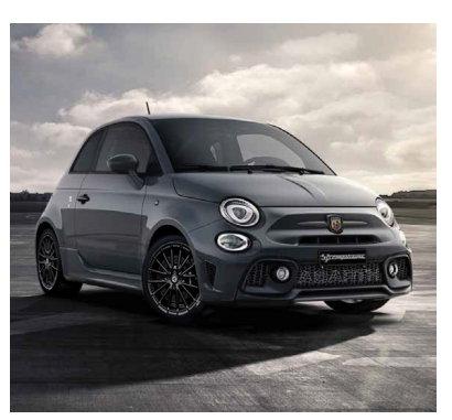
Pista Grey (735) Option