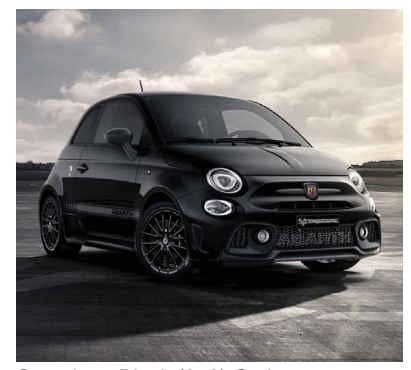
Scorpione Black (876) Option