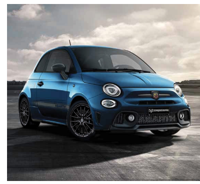
Matt Rally Blue (948) Option Competizione Only