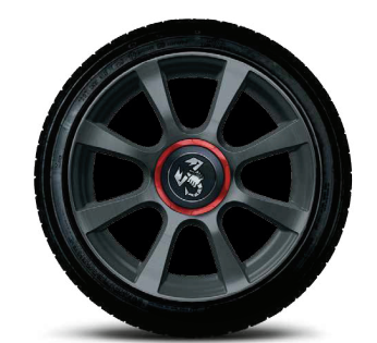
5EV - 16-Inch 8 Spoke Alloy Wheel (Standard on 595)