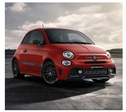
Abarth Red (176) Option