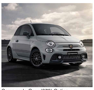
Campovolo Grey (676) Option