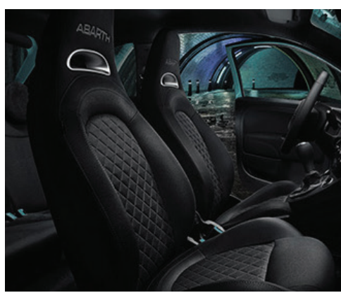
645 - Black Fabric - Standard on 595