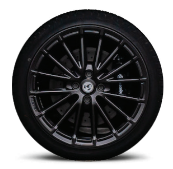
WAD - 17-Inch Montecarlo Alloy Wheel (Standard on Competizione)