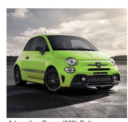
Adrenaline Green (566) Option