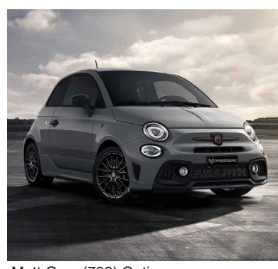
Matt Grey (708) Option Competizione Only