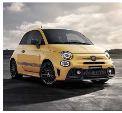
Modena Yellow (258) Option