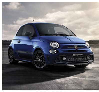
Podium Blue (369) Option